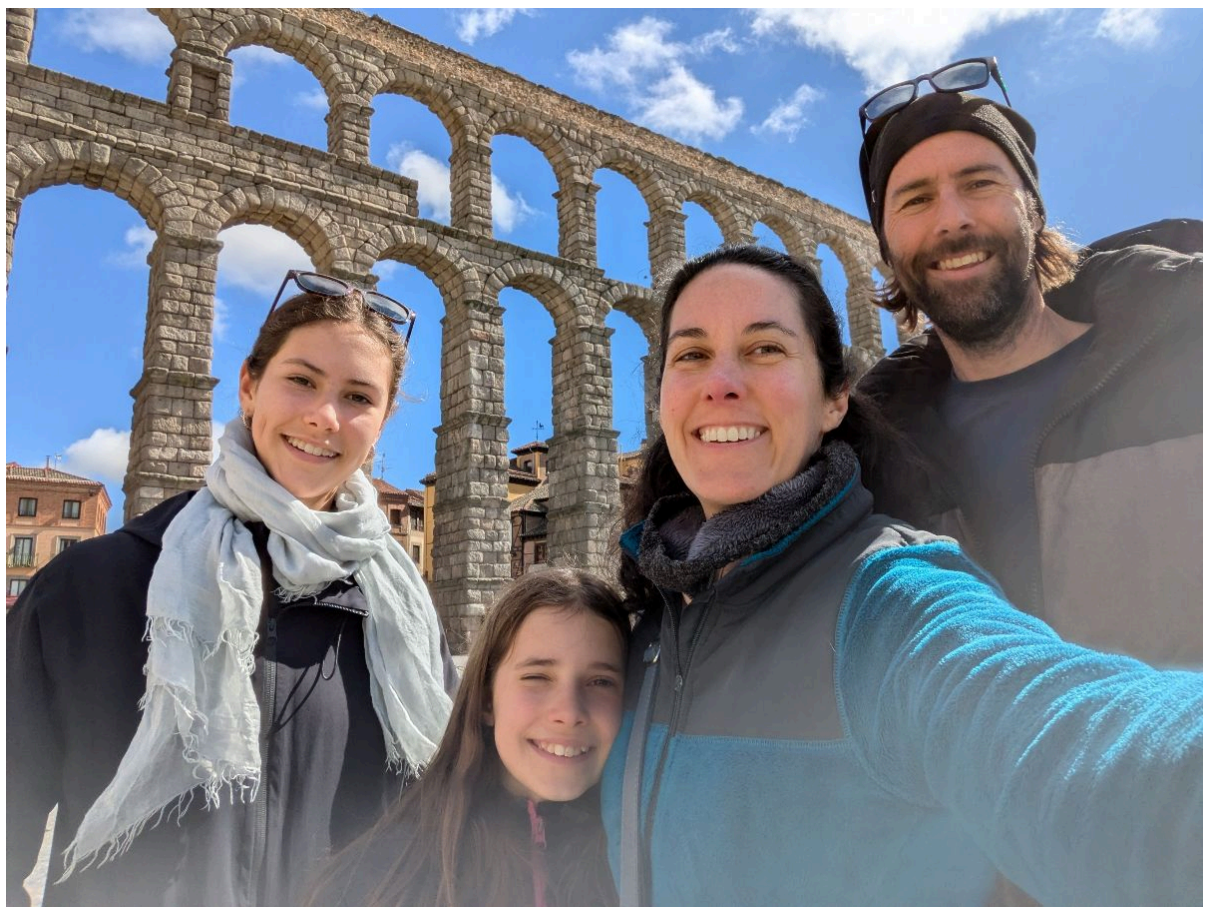
a family visit to the aqueducts of Segovia

In June and July we might be in a city near you! Email not displaying correctly? View it in your browser.