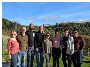
Our WEC team in the Basque Country