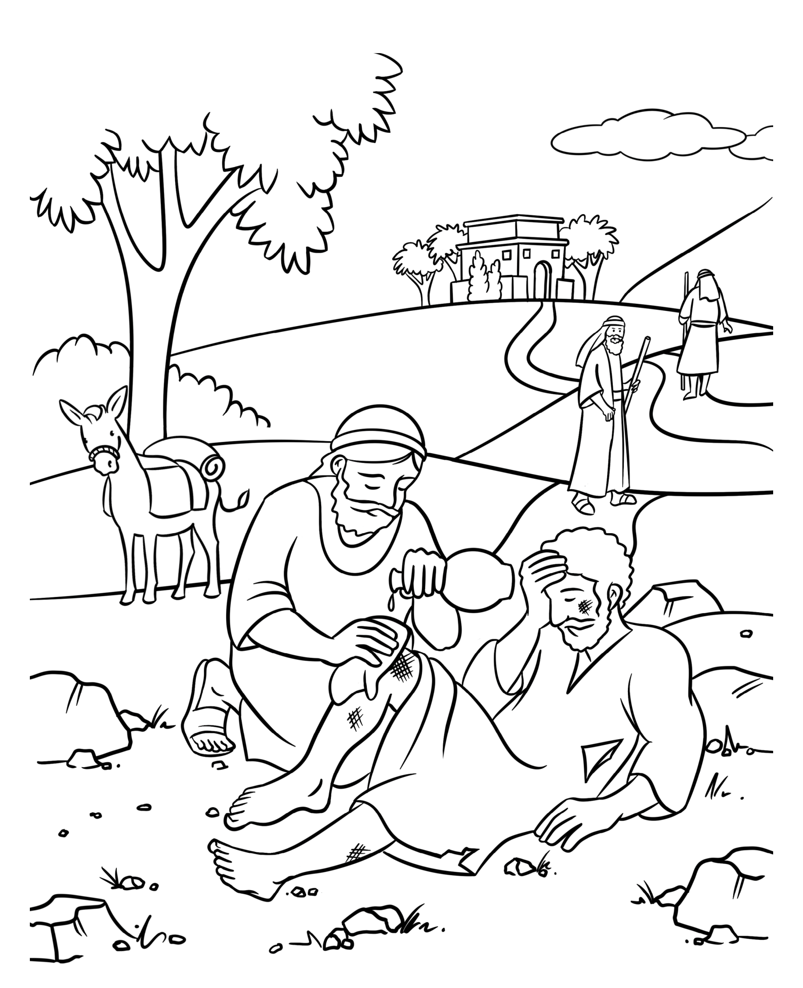
Copyright ©Sermons4Kids I All Rights Reserved I www.sermons4kids.com